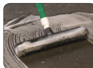
Built-in one-piece squeegee works on rough concrete surface.