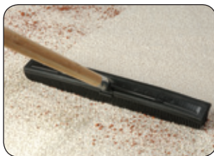
Picks up light debris from carpet, rugs, or bare floors.