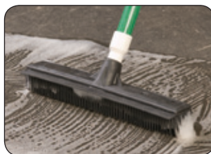
Use as an agitator for stubborn spots on tile or concrete.