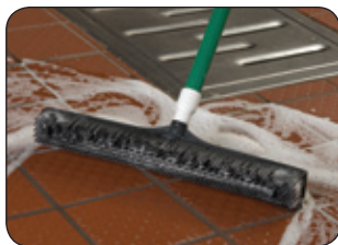
Squeegee cleans up wet surfaces quickly.