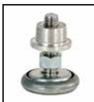
f. Adjustable Foot