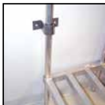
b. Wall Bracket