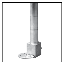
a. Floor Post Bracket