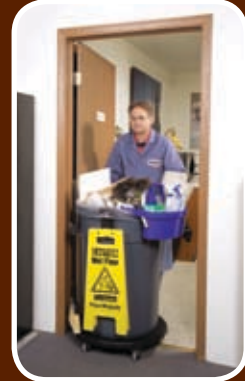
with GatorAnchor® Dolly