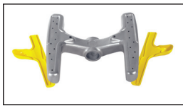
S05-204 304 Stainless steel sprayhead assembly