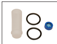
S65-339 O-ring and Screen