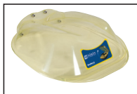
S90-390 Plastic bowl cover kit