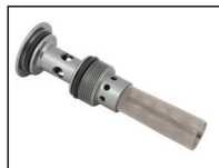
S88-068 O-ring and flow control