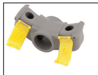
S05-190 Sprayhead assembly