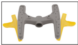
S05-192 Sprayhead assembly