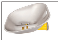
S90-391 Stainless steel bowl kit