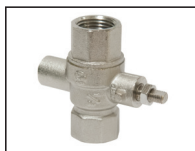
S27-327 Chrome-plated brass 1/2" ball valve