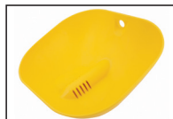
187-320 Plastic bowl