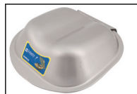
S90-388 Stainless steel bowl cover kit