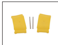
S45-2675 Eyewash cover kit