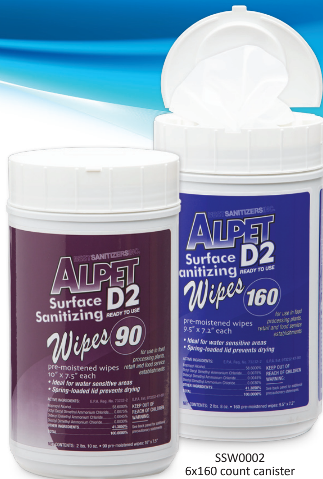
SSW0001 6x90 count canister