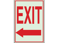
Meets OSHA 1910.37(b)(7): 80219 10' x 7" B-324 80220 14" x 10" B-324