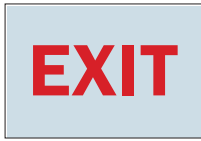
95142 7' x 10" B-997