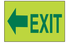
51640 12' x 9" Glow Self Adhesive