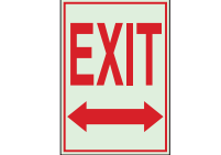
Meets OSHA 1910.37(b)(7): 80221 10' x 7" B-324 80222 14" x 10" B-324 80289 10' x 7" B-347 80290 14" x 10" B-347