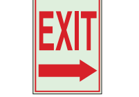
Meets OSHA 1910.37(b)(7): 80217 10' x 7" B-324