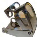
Push Button Cover IEC 22.5mm (PBL8)