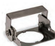
Emergency Stop Cover NEMA 30.5mm (PBL2)