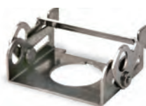
Emergency Stop Cover IEC 22.5mm (PBL4)