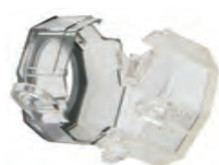
Push Button Cover NEMA 30.5 mm (PBL6)