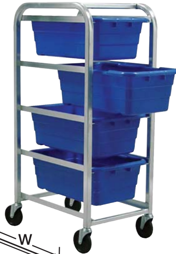
TR4-2516-8 27"L x 19"W x 51"H Comes with four TUB2516-8

All-welded aluminum Tub Rack transports and stores all types of product. Carts come complete and are shipped assembled with bins. Runners allow bins to slide in and out from both sides. Bins available in Gray, Blue and White.