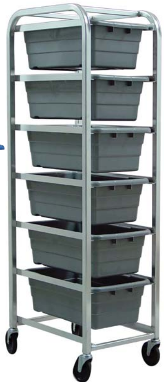
TR6-2516-8 27"L x 19"W x 71"H Comes with six TUB2516-8