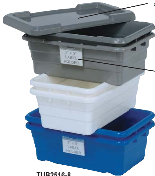
TUB2516-8 25-1/8"L x 16"W x 8-1/2"H

Manufactured of approved USDA/FDA materials, tote nests when empty or can be turned 90° to cross stack. Easy access to items when stacked. Injection molded from durable, high impact polypropylene. Easy to clean. Built in handles and bottom grooves makes handling easy. Holds up to 100 lbs. Six 1/4" drill hole pattern on bottom of bin allow for easy hole insertion for optional air flow and drainage. Available in Gray, Blue and White. 6 per carton.