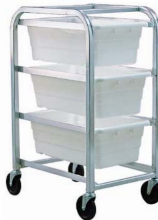
TR3-2516-8 27"L x 19"W x 41"H Comes with three TUB2516-8