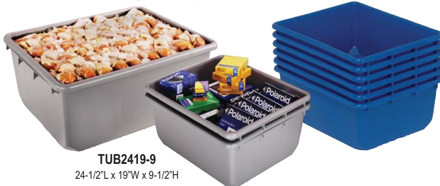
TUB2419-9 24-1/2"L x 19"W x 9-1/2"H

Manufactured of approved USDA/FDA materials, this tote is ideal in food service or dietary department applications. Strong and durable tote is injection molded from high-density polypropylene. Each tote can hold up to 100 lbs. Lightweight and economical tote is easy to clean. Rolled top rim for comfortable grip. Rounded corners add strength to stress points. Totes nest when empty and prevent jamming with rib top. Six 1/4" drill hole pattern on bottom of bin allow for easy hole insertion for optional air flow and drainage. Measures 24-1/2"L x 19"W x 9-1/2"H. Available in Gray and Blue. 6 per carton.