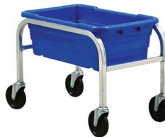
TR1-2516-8 27"L x 19"W x 19"H Comes with one TUB2516-8