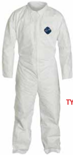
TY 120 S