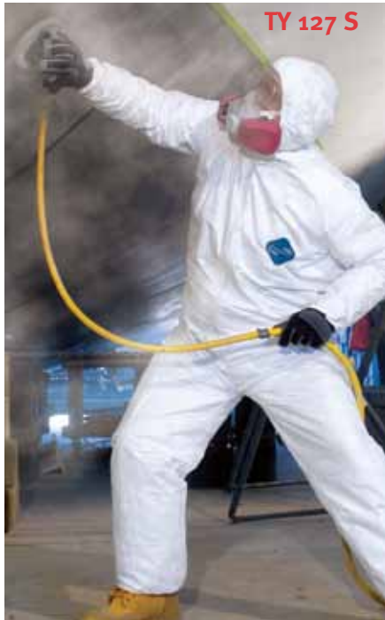
TY 127 S