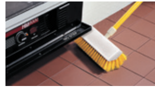
40423 - Hi-Lo Floor Scrub 40225 - Fiberglass Handle