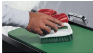
40024 - Iron Style Hand Scrub