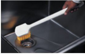
40501 - 20" All Purpose Scrub Brush