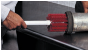
40007 - Meat Grinder/Valve Brush