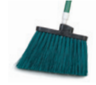
41083 - Duo-Sweep® Angle Broom