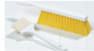
40480 - Bench Brush 40379 - Pastry Brush