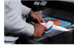
41395 - Knife Cleaning Brush