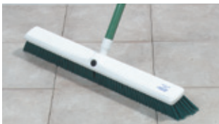
41891 - 18" Omni Sweep®