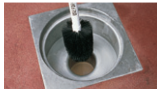
40146 - Floor Drain Brush 40236 - Drain Brush Handle