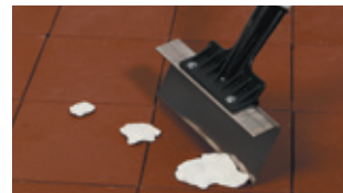
41619 - Floor Scraper