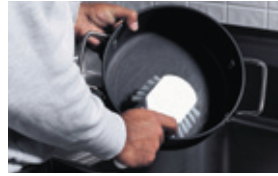
40541 - 8" All Purpose Scrub Brush