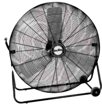
Pivoting Floor Fan 9230, 9224