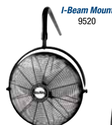
I-Beam Mount 9520