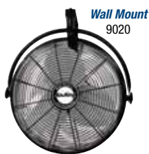
Wall Mount 9020

Secondary support cable included on Wall, Ceiling, and I-Beam Mount models.