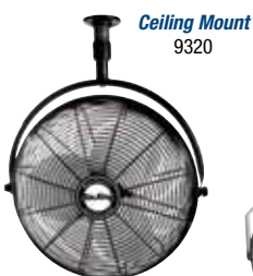
Ceiling Mount 9320