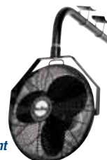
I-Beam Mount 9618