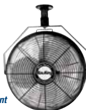
Ceiling Mount 9718