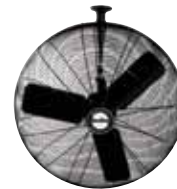
Ceiling Mount 9330, 9335, 9724, 9325