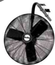
I-Beam Mount 9430, 9635, 9424, 9625