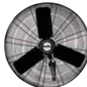
Wall Mount 9030, 9035, 9024, 9025

Secondary support cable included on Wall, Ceiling, and I-Beam Mount models.