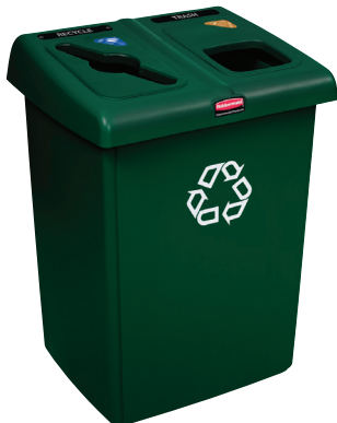
TWO-STREAM GLUTTON® RECYCLING STATION 1792340