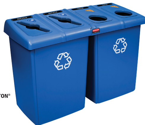
FOUR-STREAM GLUTTON® RECYCLING STATION 1792372