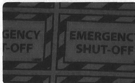
Tags and Labels Facility Glow Fire Bilingual

.010 polyester film is coated with an acrylic adhesive. This material is non-toxic, non-radioactive and glows for more than 6+ hours in total darkness. The film meets or exceeds the following standards: ASTM, IMO, ISO/CD, NFPA and OSHA.