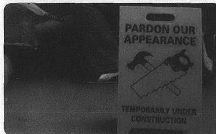
Facility Hazmat Op Haz Bilingual

Made of lightweight 4 mm corrugated polyethylene. Our floor signs can be printed on either two sides or four sides. These floor signs are water-proof and fold easily for convenient storage.