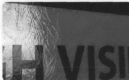
Signs Facility Fire Construction Hazmat Highway and Parking Op Haz Bilingual

.095 material is rigid, shatter-proof and dent resistant. This material will stand up to severe outdoor weather conditions as well as weak alkalis and acids. Signs are supplied with radius corners and pre-drilled mounting holes.