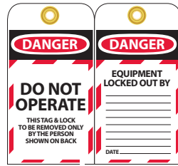
LOTAG10 10/PACK or 25/PACK