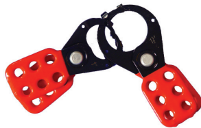
SL1 & SL15