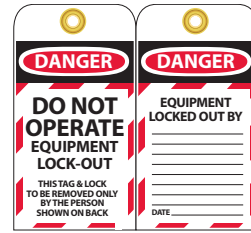
LOTAG11 10/PACK or 25/PACK