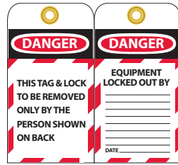
LOTAG1 10/PACK or 25/PACK