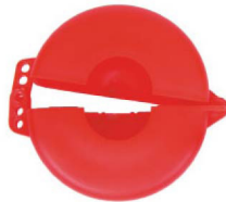
VL02R & VL04R