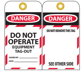
LOTAG13 10/PACK or 25/PACK