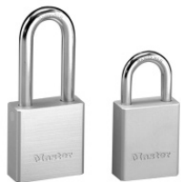
No. 570DLHPF No. 570DPF