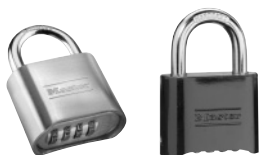
No. 175D No. 178D