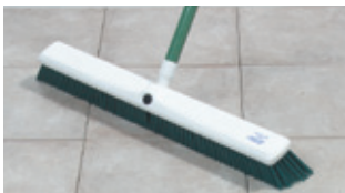
41891 - 18" Omni Sweep®