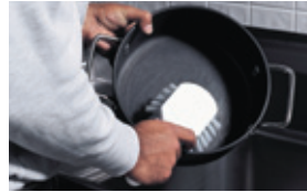
40541 - 8" All Purpose Scrub Brush