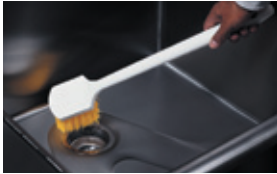
40501 - 20" All Purpose Scrub Brush