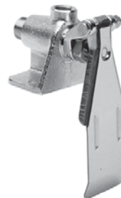
Model 110S Model 110L