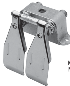
Model 109S Model 109L