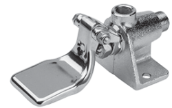
Model 102S Model 102L