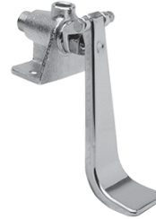
Model 104S Model 104L