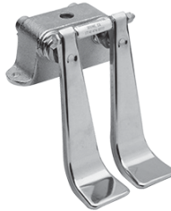
Model 103S Model 103L