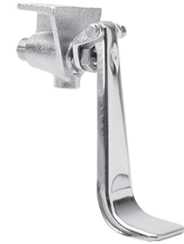
Model 106S Model 106L