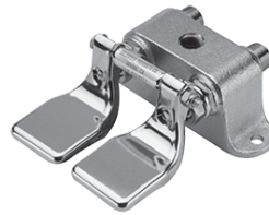
Model 101S Model 101L