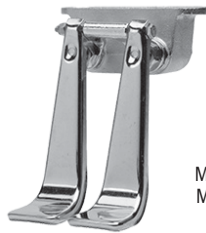
Model 105S Model 105L