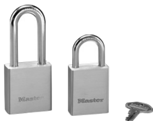
No. 576DLHPF No. 575DPF

NOTE: WHEN ORDERING KEYED ALIKE PADLOCKS, EACH DIFFERENT KEYED ALIKE SET IS A SEPARATE LINE ITEM.