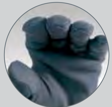
We have pinched the fingertips on selected styles. This allows you more comfort and tactility because there are less seams and material to get in the way.