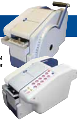
TWA 1000-M Manual Taper

This superior line of dispensers offers improved features and benefits enhancing the value created by an integrated system of closure material and dispenser. The increased capabilities highlighted in the TWA 1000-M Manual Taper and TWA 1000-E Electric Taper provide the quality your production requires.