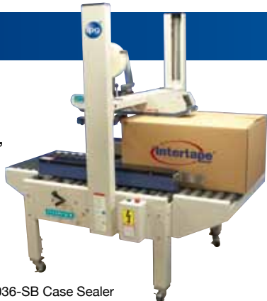
USA 3036-SB Case Sealer

Ask about Interpack™’s equipment capabilities and programs... including the Tape Head Program, Tape Incentive Program, Parts Voucher, Spare Parts Kit and more.