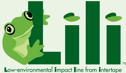
Low-environmental impact line from Intertape™