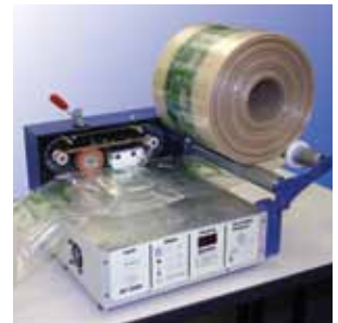
AP-2000 Inflatible Air Pillow System

For years, IPG® has been a trusted source for the products that secure your packages as a leading supplier of carton-sealing tapes and stretch film. It only makes sense that you would also rely on Intertape to protect the contents of your packages. That is why the iCushion® brand Protective Packaging line emerged with the fastest Air Pillow System on the market and continues to expand.