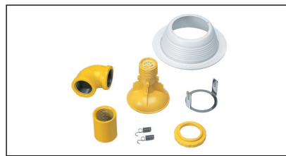
□ S24-202 Plastic showerhead, white steel in-ceiling recessed shroud assembly, ring, coupling and 1" diameter 90° elbow