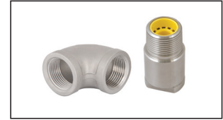
□ S24-200 Stainless steel showerhead and 1" diameter 90° elbow