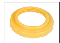
□ S154-147 Ring only