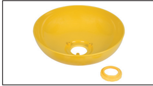
□ S24-192 Plastic shroud and ring (showerhead not included)