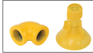
□ S24-194 Plastic showerhead and 1" diameter 90° elbow