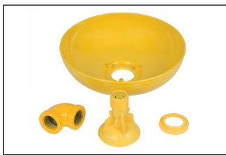
□ S24-195 Plastic shroud with ring, plastic showerhead and 1" diameter 90° elbow