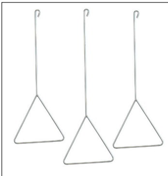
□ 128-156A Drench shower handle for standard (non-barrier-free) units (25½" x 9")