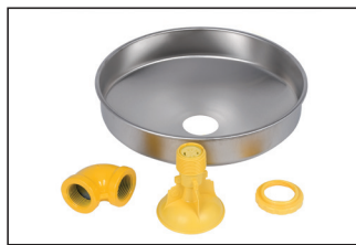
□ S24-196 Stainless steel shroud with ring, plastic showerhead and 1" diameter 90° elbow