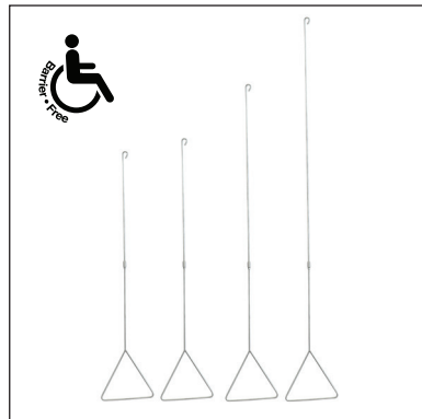
□ 128-156C Drench shower handle (48" x 9")