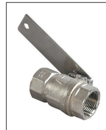
□ S30-059 Chrome-plated brass 1" NPT ball valve with lever