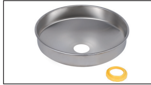
□ S24-193 Stainless steel shroud and ring (showerhead not included)