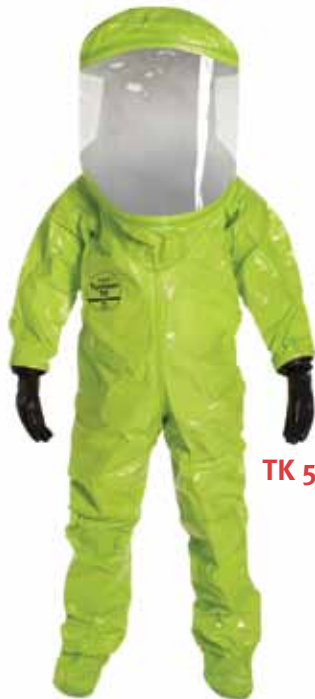
TK 555 T