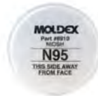
8910 N95 Filter