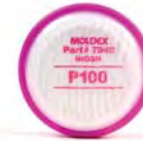
7940 P100 Filter Disk