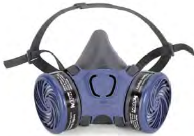
7101 Small 7102 Medium 7103 Large