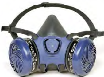
Oil-Free 7111 Small 7112 Medium 7113 Large