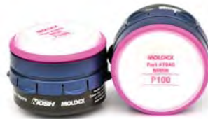
7140 Organic Vapor Cartridge/P100