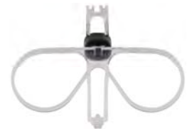
0098 Spectacle Kit