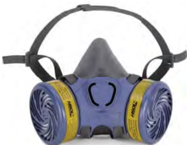
7601 Small 7602 Medium 7603 Large