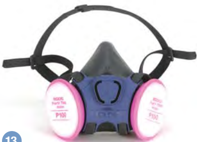
7941 Small 7942 Medium 7943 Large