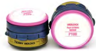
7640 Multi-Gas/Vapor Smart® Cartridge/P100