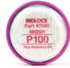
7960 P100 Filter Disk Plus Nuisance Organic Vapors