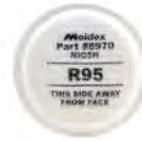
8970 R95 Filter