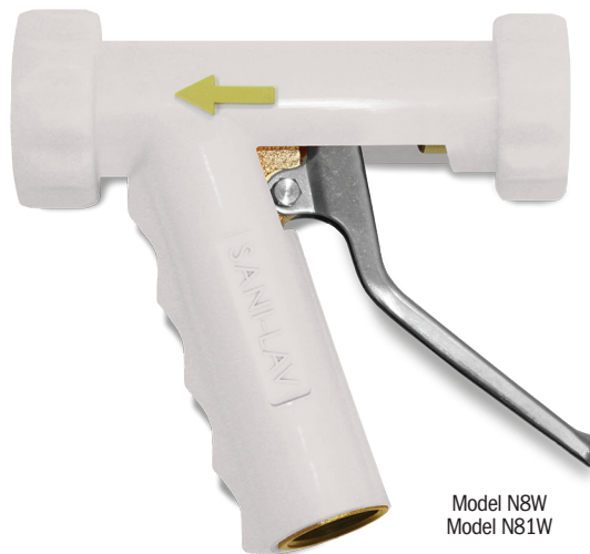
Model N8W Model N81W