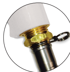
Model N8W20 Model N81W20