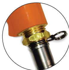
Model N820 Model N8120