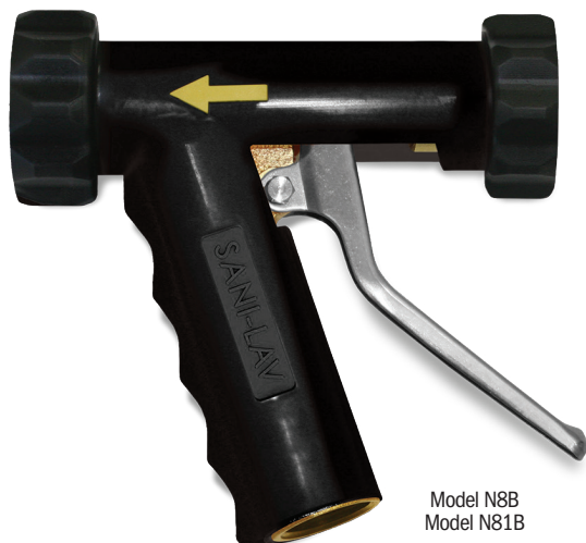
Model N8B Model N81B

N20 Swivel 3/4" GHT, 3/4" hose barb included with Models (N820, N8120, N8W20, N81W20, N8B20 and N81B20)