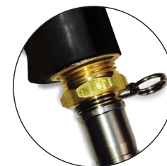
Model N8B20 Model N81B20