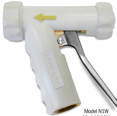
Model N1W Model N1AW Model N1SSW Model N1TW