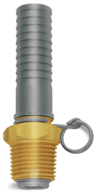
Model N20 3/4" GHT, 3/4" Hose Barb*