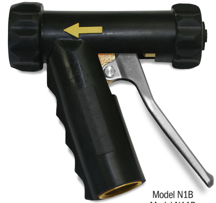
Model N1B Model N1AB Model N1SSB Model N1TB