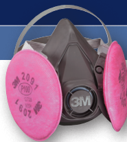
3M™ Half Facepiece Reusable Respirator 6000 Series 6100, 6200, 6300