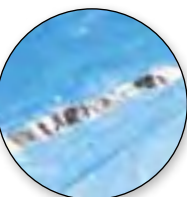
Foil strip makes this sleeve highly detectable