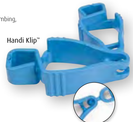
Ball & Socket Joint