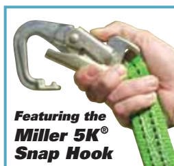
Featuring the Miller 5K® Snap Hook

The innovative Miller BackBiter Tie-Back Lanyard with the Miller 5K® Snap Hook was designed from top to bottom for tie-back use.