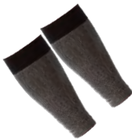
Style No. 6966