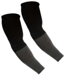
Style No. 6905